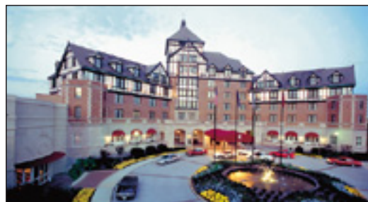
The Historic Hotel Roanoke & Conference Center